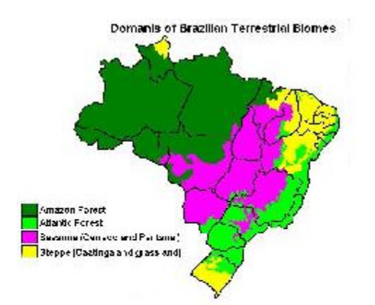
Figure 3 - The terrestrial biomas of Brazil, adapted from a publication of the Ministry of Environment in 1996 (67)